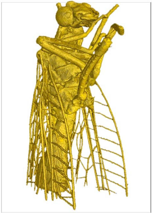
Image: The world's first image of a fly taken with the help of an all-laser-based X-ray tomography imaging method. It consists of around 1500 individual images. Even extremely fine structures appear in three-dimensional detail. These would remain invisible in a conventional X-ray image.

When the physicists Prof. Stefan Karsch and Prof. Franz Pfeiffer illuminate a tiny fly with X-rays, the resulting image captures even the finest hairs on the wings of the insect. The experiment is a pioneering achievement. For the first time, scientists coupled their technique for generating X-rays from laser pulses with phase-contrast X-ray tomography to visualize tissues in organisms. The result is a three-dimensional view of the insect in unprecedented detail.